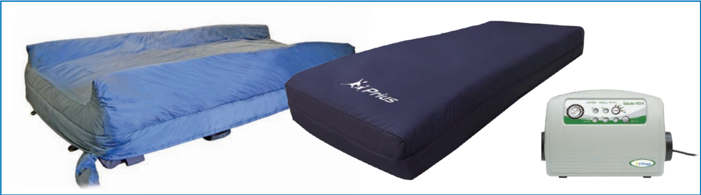
Optional Raised Bolster Cover available for added patient safety. Bolster cover has center access providing easy ingress and egress.